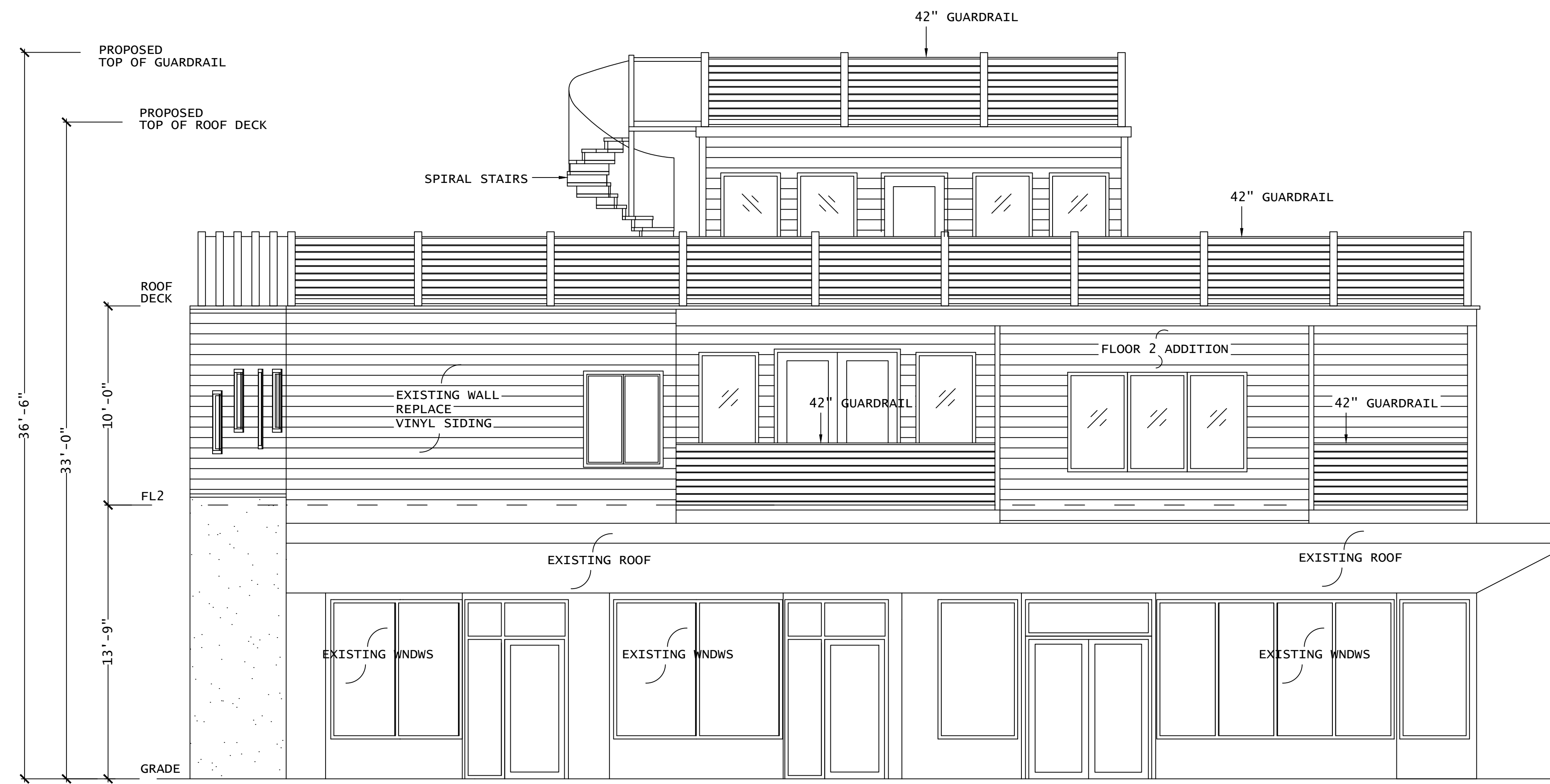
PROPOSED OCEAN AVENUE / EAST ELEVATION 1/4"=1'-0"