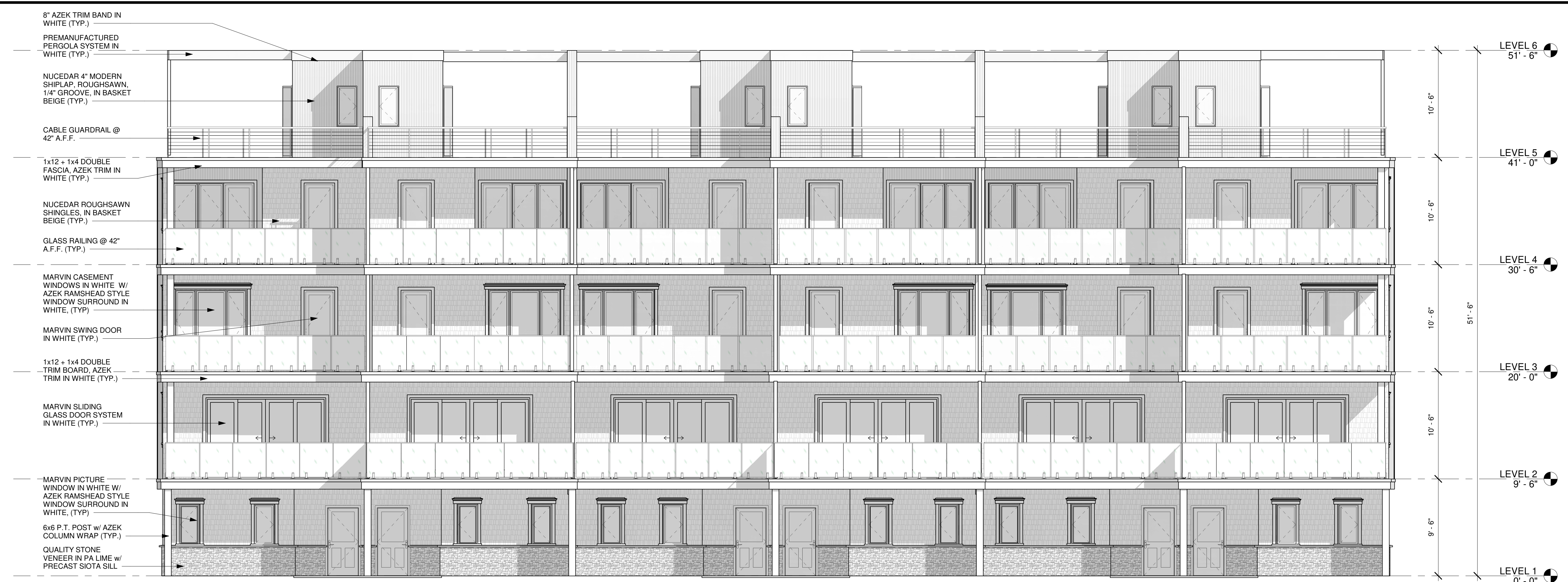
① FRONT ELEVATION 3/16" = 1'-0"