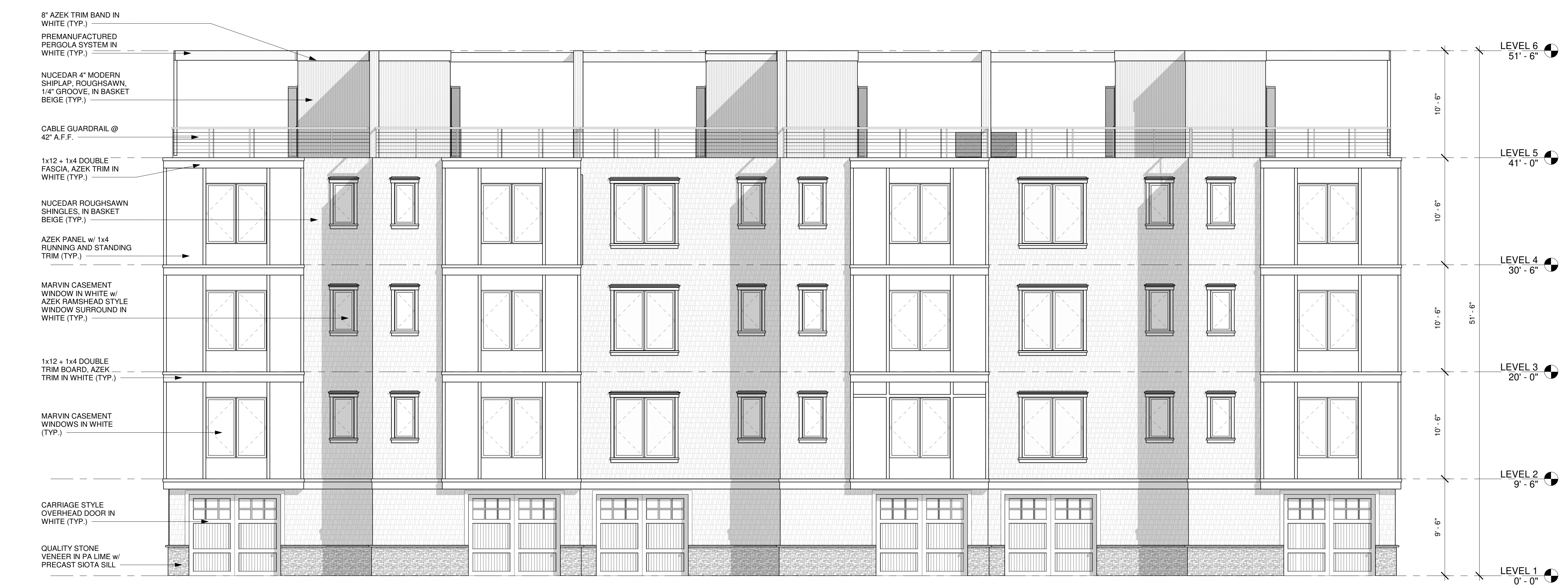
② REAR ELEVATION 3/16" = 1'-0"